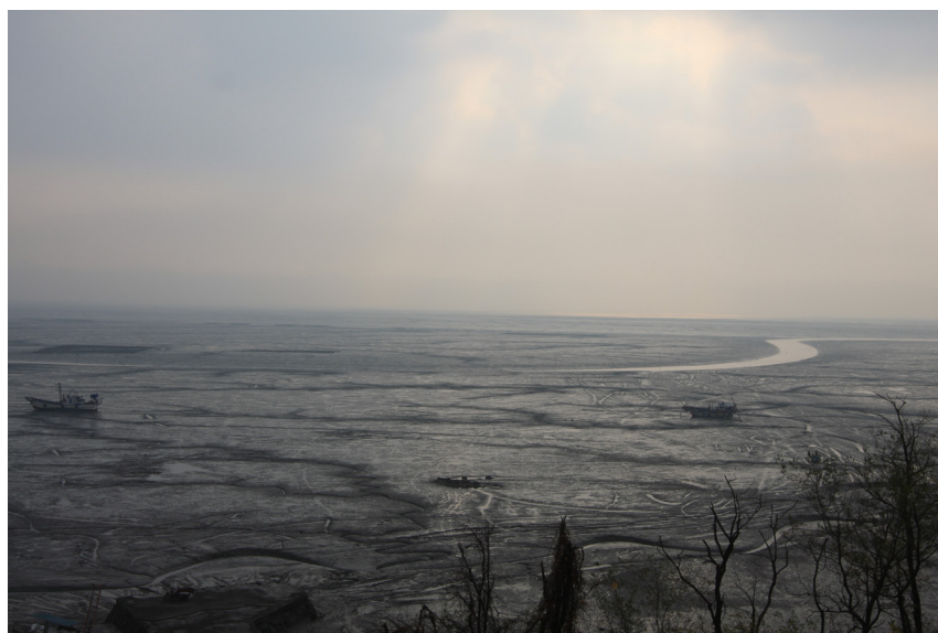
Figure 2. Dongmak tidal flat in Gangwhado Island, Incheon.

Park (2001) compared two famous tidal flats in Korea, namely Suncheonman (bay) and Gangwhaman tidal flats, and ascribed the differences in mean particle size to the difference in tidal range. Ryu (2003) investigated the seasonal variation of particle size in Hampyeongman and Gwnagyangman areas. Lee and Cho (2005) did similar analyses in Beopseongman; Jang et al. (2010) did in intertidal zone in Baramarae beach, and Shin (2011) in his latest Ph. D. dissertation spatio-temporal variation of sedimentary characteristics in tide-dominated estuary area of Mosanman bay. One more thing worth mentioning is that much more researches are published in the field of Earth Science