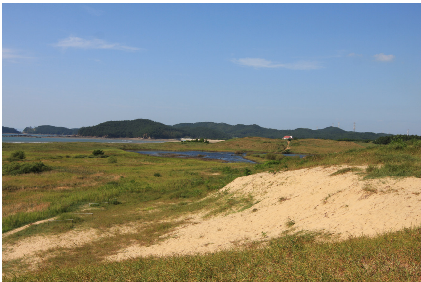
Figure 3. Coastal sand dune in Sinduri beach, Choongnam.

Recently, Kim (2012) summarized the development of Korean coastal geomorphological studies. Erosional landforms including marine terraces, sea cliffs, and wave-cut platforms are the main topics in coastal geomorphology in 1980s. Oh K.H. is leading figure in that period, who classified marine terraces according to height and tried to examine closely the tectonic uplifting movement during the Quaternary. Choi S.K.