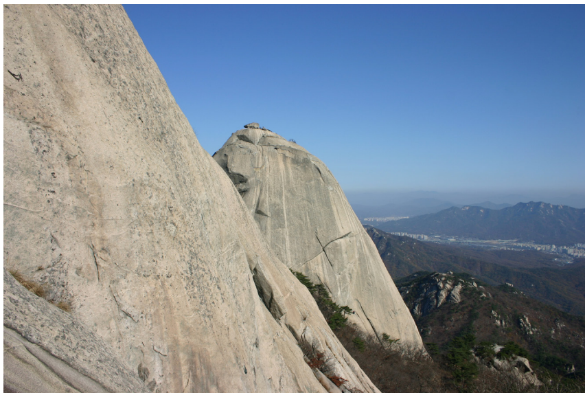
Figure 1. Insubong peak, which is a typical granite dome in Bukhansan National Park, Seoul.

Park in his 1999 article summarized many weathering-related papers in Korea and concluded that many workers have not reached the conclusion so far. The consensus, however, is that micro relief found in weathered granite resulted from salts derived from chemical weathering initiated along joints and fractures, especially those where water can reside temporarily at least. Remaining unsolved questions are as follows; firstly, whether tafoni are the results from the sub-areal or under-ground weathering. Secondly, tafoni may indicate climatic conditions of the past in some cases. Thirdly, basal rock properties may determine the development of tafoni. Fourthly, distributions are not restricted to coastal areas with ample supply of sea salt and actually they are plenty in granite area far from the coastal area. And finally, the textural properties of host