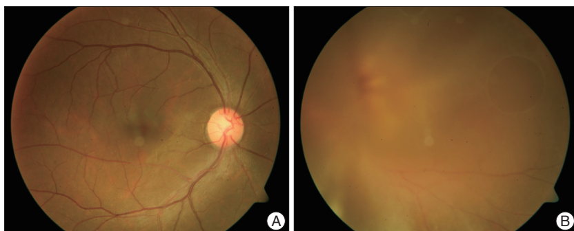
Fig. 3. Fundoscopic findings. A : Right eye three months after ictal event. B : Left eye shows severe vitreous opacities.