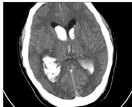
Fig. 1. Brain computed tomography scan shows intraventricular hemorrhage in both lateral ventricles.

Cerebral angiography showed severe bilateral stenosis at the distal internal carotid artery and basal moyamoya vessels. It was compatible with moyamoya disease (Fig. 2). Emergent extraventricular drainage was performed. His mentality gradually improved to alert. Ophthalmologic examination at our hospital detected a vitreous hemorrhage in his left eye (Fig. 3B), with right eye remaining normal (Fig. 3A). In spite of three months conservative care, his visual acuity was not improved. Vitrecto-