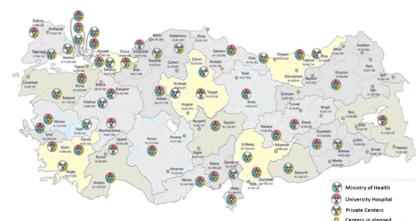
Figure 1. Regions of Health and NM Laboratories

There is no a universally accepted guideline or country specific thresholds for gamma camera counts or NM expert numbers. There are 19 units of gamma camera per a million populations in Canada. According to a study in India in 2002, the average of gamma cameras is reported as a ratio 72/one million people for developed countries. In the comprehensive study carried out by MoH "National Special Feature Requiring Health Service Plan", the number of gamma camera recommended for major cities (as Ankara, Istanbul and Izmir) is 1 gamma camera per maximum of 100.000 population. The number of gamma cameras recommended for major health provinces is one