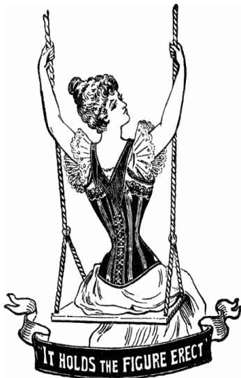
<Figure 2> The Corset