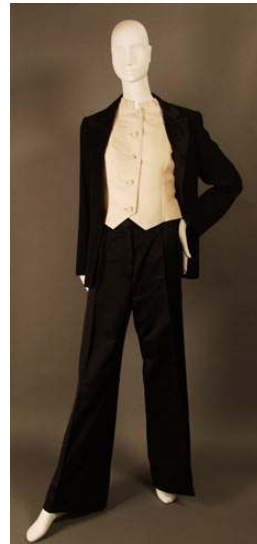
<Figure 3> Tuxedo