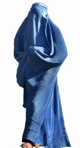
<Figure 4> Burka