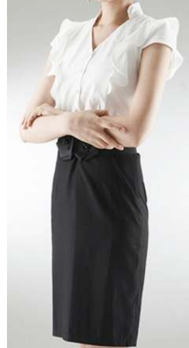
<Figure 5> White blouse and skirt