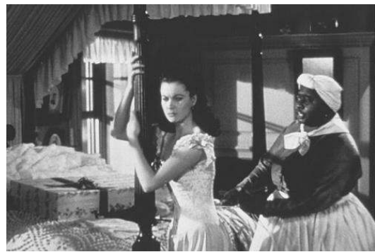
<Figure 1> Gone with the wind

Seoul, Korea. The participants' ages ranged from 18 to 33 years, with a mean age of 20.93 (SD = 2.381). The questionnaires were completed in the university classrooms. The participants' monthly clothing expenditure was less than $222 for approximately 59%, between $200 and $400 for 29%, and over $400 for 11%.