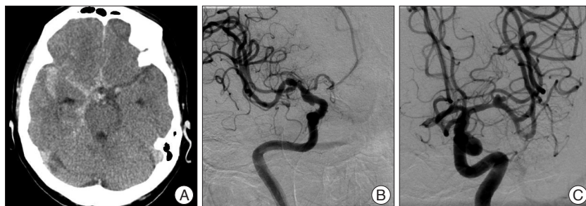
Fig. 1. Initial computed tomography (A) shows diffuse subarachnoid hemorrhage, except left sylvian fissure. Conventional cerebral angiography demonstrates a fusiform dissecting aneurysm involving the right distal internal carotid artery (B) and a bilobulated saccular aneurysm at the middle cerebral artery bifurcation (C).

As a fusiform dissecting aneurysm of the distal ICA is a rare pathologic condition, the clinical features remain unclear. Re-