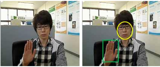
Fig. 2. Hand detection and Tracking (left: Original, right: Track result)

than the face region. In addition, we use blob analysis to determine the boundary area, bounding box and centroid point for each hand region. Consequently, we select a search area in the next frame (Fig. 2(right side)) around the bounding box that is determined from the last frame in order to track the hand and reduce the gesture region of interest. Thereby, the new bounding box is calculated and the centroid point is determined. By iteration of this process, the motion trajectory of the hand so-called gesture path is generated from connecting hand centroid points (Fig. 3).