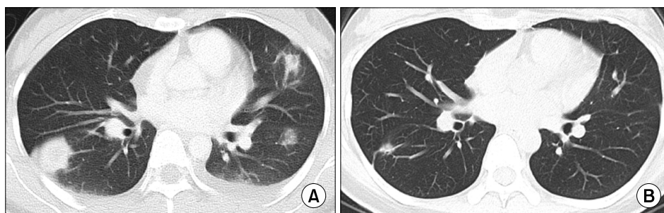
Figure 2. (A) Initial chest computed tomography (CT) image shows multiple nodular infiltrates located predominantly in the periphery of both lower lobes and a small amount of pleural effusion in the left hemithorax. (B) Three months after the discontinuation of balsalazide, a chest CT shows marked improvements or complete resolution of nodular infiltrates in both lungs and disappearance of the left pleural effusion.

Bronchoscopy with bronchoalveolar lavage (BAL) was performed to evaluate nodular infiltrative lesions and rule out infection or malignancy. There is no endobronchial lesion on bronchoscopy. BAL fluid recovered from the lingular segment of the left upper lobe showed prominent lymphocytosis (40% of lymphocytes, 55% of macrophages, and 5% of neutrophils). No malignant cells were observed in BAL cytological analysis. BAL cultures for viruses, bacteria and fungi were negative. For confirmative diagnosis of the pulmonary lesions, video-assisted thoracoscopic surgery was performed. Surgical specimens obtained from the left lower lobe revealed extensive necrosis with intraluminal organization that resembled BOOP (Figure 3A). Distinct multinu-