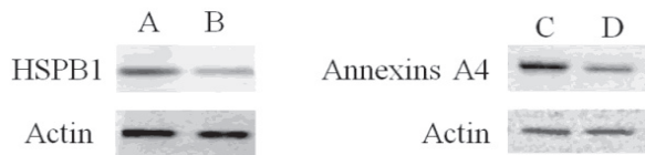
Figure 2. Western Blot Results of HSPB1 and Annexins A4. A and C: colorectal cancer tissues; B and D: normal tissue up-regulated and 4 proteins were down-regulated.