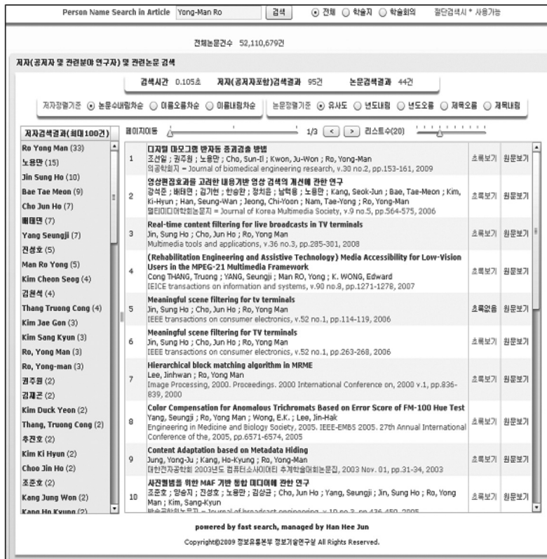
Fig. 4. Essay search system for personal name queries