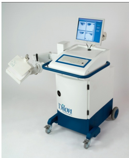
Fig. 1. Dilon 6800 (Dilon Technologies Inc, Newport News, USA).

BSGI was performed 3-12 days after the menstrual periods of selected women or on postmenopausal women. After the 99m Tc-sestamibi injection, the images were obtained using a BSGI 6800 gamma camera manufactured by Dilon (Fig. 1). The camera size and gantry design provided the flexibility re-