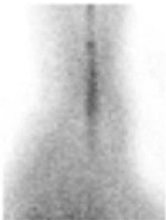
Fig. 2. Vascular trapping can be reduced as exercising and flushing with normal saline.

The craniocaudal and mediolateral oblique images are taken within 10 minutes after the injection. As ^{99m}\text{Tc} -sestamibi is relatively less absorbed by fat tissues, more than 100k counts is used for 5-10 minutes. A paddle attached to a detector is used when such images are taken. As the paddle contains lead, it reduces the artifacts caused by the accumulated ^{99m}\text{Tc} -sestamibi in the surrounding organs. After the craniocaudal and mediolateral oblique images are obtained,