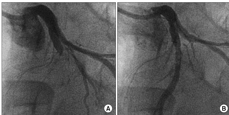
Fig. 1. Coronary angiogram (CAG) before and after percutaneous coronary intervention (PCI). (A) CAG shows total occlusion of the proximal left anterior descending coronary artery. (B) After the PCI, successful reperfusion was obtained.

After careful discussion with the patient and his family, they agreed to a trial of SCS. The patient was taken to the operating room, monitored, and placed in the prone position. Anesthesia was accomplished by local anesthetic infiltration. A 15-gauge Tuohy needle was inserted in the T4-5 interlaminar space under fluoroscopic guidance. The epidural space was identified using a loss-of-resistance technique. An Octad lead 3778 (Medtronic Inc., Minneapolis, Minnesota, USA) was inserted through the needle and advanced under fluoroscopic guidance until the tip lay at the C7-T1 intervertebral disc level (Fig. 2). The stimulation parameters were pulse width of 270 \mu s, amplitude of 2.0 mA, and frequency of 50 Hz. During the 10 days of trial stimulation, the intensity and frequency of the patient's chest pain was reduced by 60-70% without epidural infusion of morphine. Therefore, a permanent pulse generator (RestoreUltra™, Medtronic Inc., Minneapolis, Minnesota, USA) was implanted into the subcutaneous space of the right lower quadrant of the abdomen. The patient's chest pain decreased to 2 to 3 on the NRS, and he was satisfied with a treatment regimen of SCS and oral morphine 90 mg, gabapentin 1,800 mg, and nortriptyline 20 mg per day.