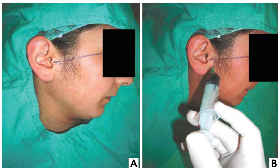
Fig. 1. A. The reference line for locating the articular fossa. B. Autologous blood injection.