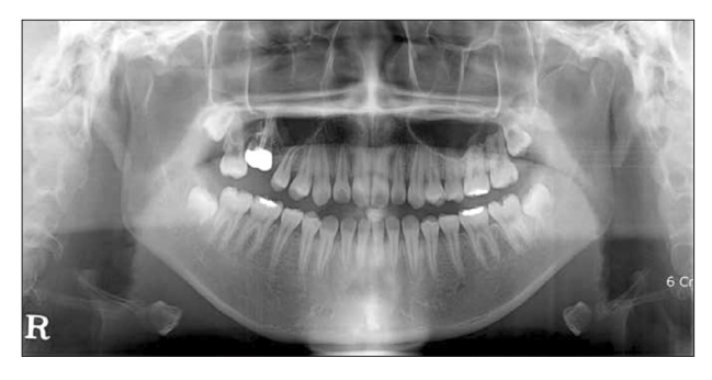
Fig. 1. Panoramic radiograph taken at the patient's first visit. An ankylosed right maxillary first molar is noted with full gold crown and root canal.

A 16-year-old female patient visited the Department of