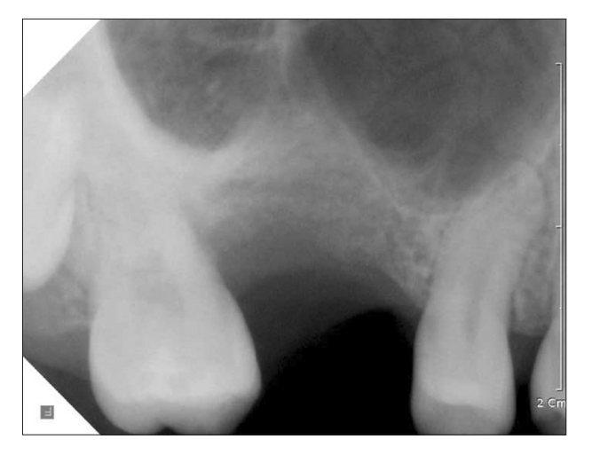
Fig. 10. The extracted tooth. Jae Ho Hwang et al: A lateral approach to the maxillary sinus for simultaneous extraction of an ankylosed maxillary molar and sinus graft: a case report. J Korean Assoc Oral Maxillofac Sure 2012

The treatment of an ankylosed tooth is not an easy task since the surgery itself is difficult and patient age and ankylosis location must be considered. Chaushu et al. <sup>19</sup> suggested some treatment methods for maxillary molars with infraocclusion: periodic observation, surgical removal, prosthetic restoration, and orthodontic treatment. Raghoebar