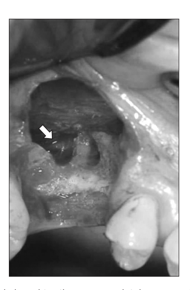
Fig. 6. The ankylosed tooth was completely removed. Some rootcanal filling material was observed over the apex of the adjacent teeth (arrow).

Jae Ho Hwang et al: A lateral approach to the maxillary sinus for simultaneous extraction of an ankylosed maxillary molar and sinus graft: a case report. J Korean Assoc Oral Maxillofac Surg 2012