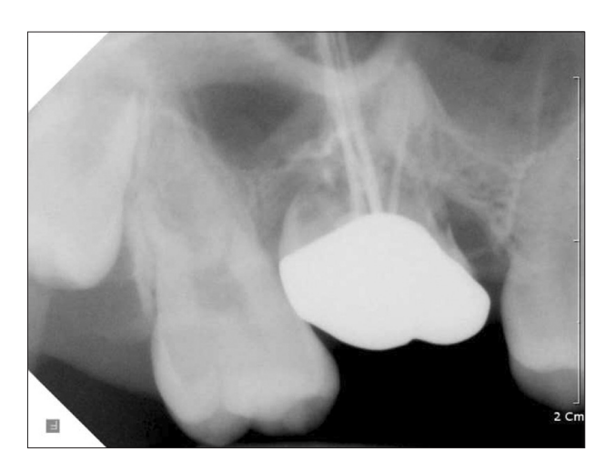
Fig. 2. Periapical view showing root resorption and loss of lamina dura around the infraoccluded tooth.

Advanced General Dentistry, College of Dentistry, Yonsei University to have her right maxillary first molar extracted. This patient made a prior visit to the Orthodontics Department of the hospital to address her different vertical teeth height.