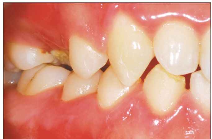
Fig. 2. Preoperative buccal view showing fractured maxillary second premolar.

with 0.25 g of xenograft bone (Bio-Oss, Geistlich Pharma AG, Wolhusen, Switzerland).