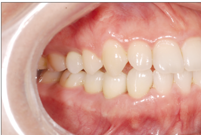
Fig. 10. Postoperative appearance one year later following immediate implant placement and immediate loading.