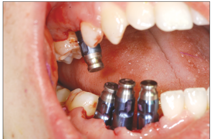
Fig. 4. Impression taking by using transfer impression coping during first surgery.