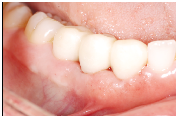
Fig. 6. Postoperative buccal view following four weeks of implant placement and loading.