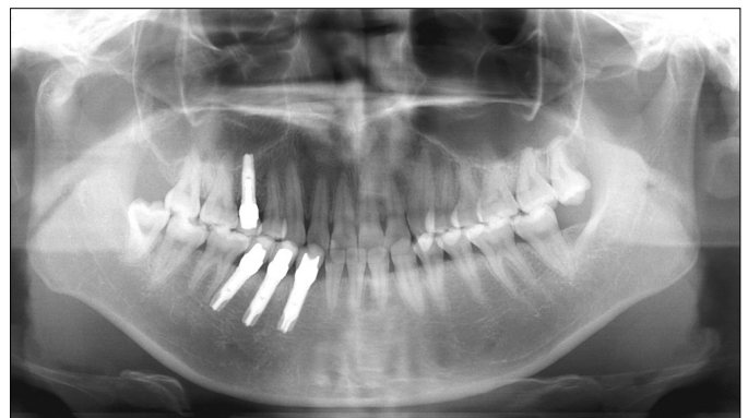
Fig. 11. Panorama radiographic image after one year following immediate implant placement and immediate loading.