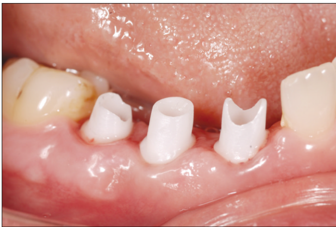
Fig. 7. Zirconia abutment connection to implant fixture.

Beach Gardens, FL, USA) and pressable all-ceramic restoration (IPS-Empress II, Ivoclar Vivadent AG, Schaan, Liechtenstein) in response to the patient's high esthetic expectation. After taking implant level impression, master cast was poured and mounted using facebow transfer. Zirconia abutments were milled and definitive prostheses with canine guided occlusion were made with IPS- Empress II system. Definitive restorations were tried-in intraorally. Zirconia abutments were tightened to 20 Ncm of torque following the manufacturer's recommendation (Fig. 7). Definitive restorations were permanently cemented with resin cement (Rely-X Unicem, 3M ESPE, Seefeld, Germany) after finishing and polishing (Figs. 8, 9).