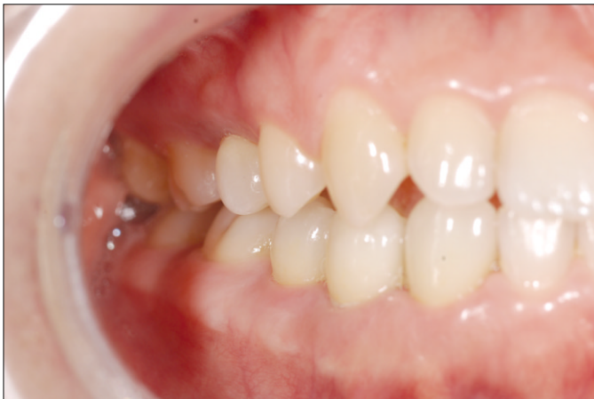
Fig. 8. Buccal view of the definitive restoration in place.

After cementation of definitive prosthesis, the prosthesis was reevaluated with one-, three-, and six-month follow-up intervals. Soft tissue was stable and the prosthesis was functioning properly one year after immediate loading (Figs. 10, 11).