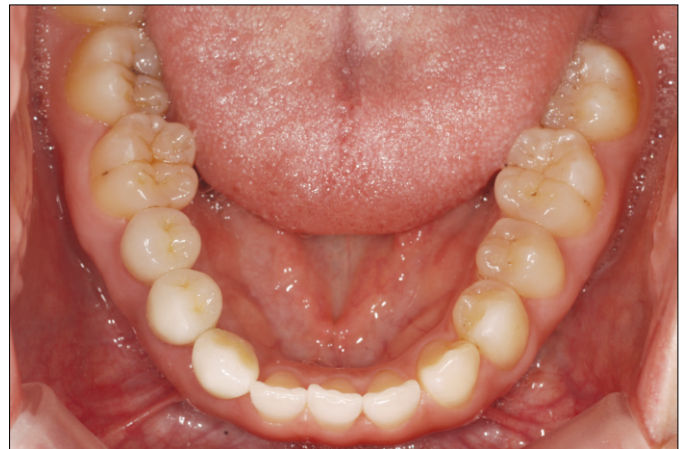
Fig. 9. Occlusal view of the definitive restoration in place.