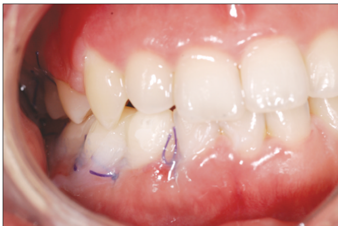
Fig. 5. Immediate loading by provisional prosthesis with canine protected occlusion.