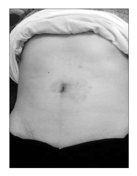
Fig. 3. Photograph of the abdomen taken 1 month after the operation shows excellent cosmesis with minimal scar.

In addition, SILS has some technical challenges. Insertion of several instruments, along with the laparoscope, into the abdominal cavity through a single incision markedly decreases the range of motion and results in conflict between instruments. This conflict makes surgical dissection much more difficult compared to conventional multiport laparoscopic surgery. It is also difficult to keep an ideal view due to consistent clash of camera with operating instruments, so that expert camera operator experienced in handling flexible or 30 degree laparoscopic graspers, shears, and staplers) could improve the performance with less interference, and the recently introduced pre-bent instruments further facilitate the