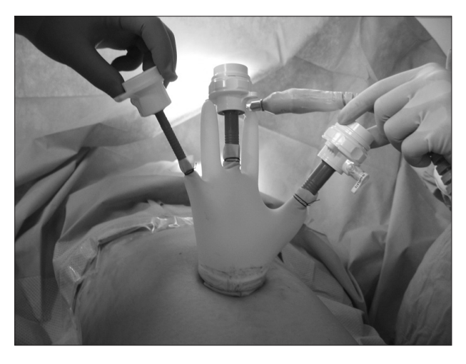
Fig. 1. Home-made single-port device was made from small wound protractor and a surgical glove with conventional laparoscopic trocars.

The diagnostic tools used most often to characterize the tumor before surgery were esophagogastroduodenoscopy (EGD) and computed tomography. All 10 patients underwent both, and 9 out of 10 also underwent additional endoscopic ultrasonography to delineate the anatomic layer of the tumor origin. All tumors were detected by EGD, and the mean tumor size measured by EGD was 2.5 cm (range, 1.2~5.0 cm). According to the EGD findings, all tumors