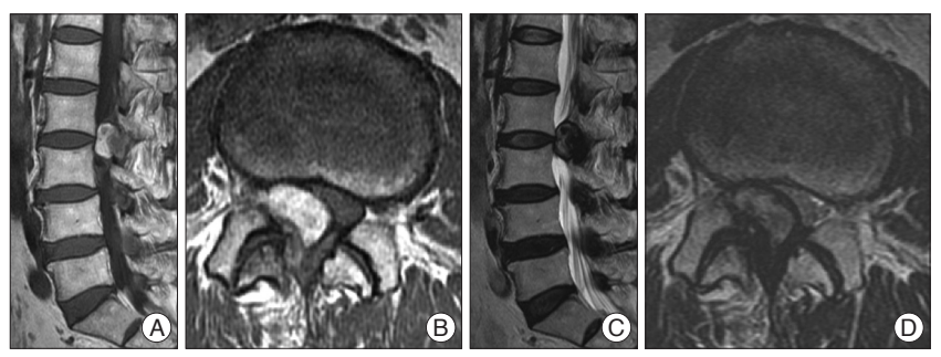
Fig. 1. Magnetic resonance images are showing the presence of a cystic mass in the right L2-L3 facet joint with arthritis compressing the L3 right root and the dural sac. There are showing a hyperintense on T1-weighted image (A and B) and hypointense on T2-weighted image (C and D) consistent with hemorrhage.