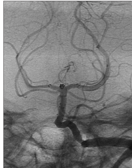
Fig. 2. Immediately post-treatment, working unsubtracted view of the left vertebral artery angiogram showing optimal deployment and no contrast dye filling in aneurysm sac after Y-stenting coiling.

aneurysm base. 2.5×20 mm and 2.5×20 mm Neuroform stent placed was 20 mm in length and was deployed from the left PCA into the basilar artery. The microwire was pulled retrograde into basilar artery, then advanced through the stent struts. The second, 20 mm stent, was advanced over the wire through the first stent within the basilar artery then through the struts of the left PCA stent and into the right PCA.