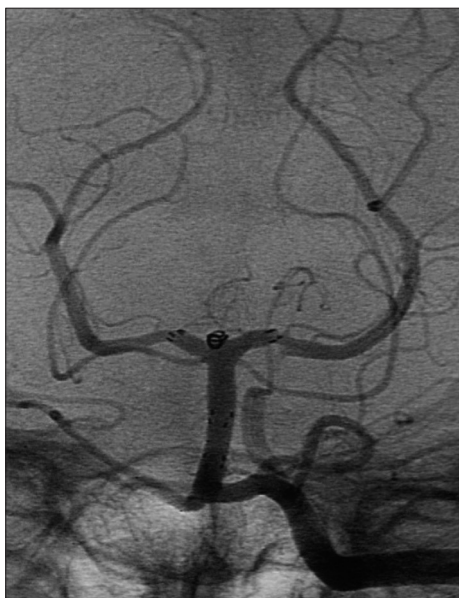
Fig. 3. Follow-up angiography was performed 12 months after treatment. Working unsubtracted view of left vertebral artery angiography shows a no interval change after initial treatment.