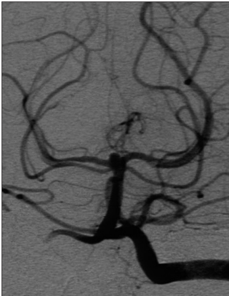
Fig. 1. Working view of the left vertebral artery angiogram showing the aneurysm at the basilar tip prior to endovascular intervention.

Class 1 : complete occlusion, Class 2 : remnant neck (nearly complete occlusion). H-H grade : Hunt and Hess grade, mRS : modified Rankin Scale, Cx : complication, MCA : middle cerebral artery