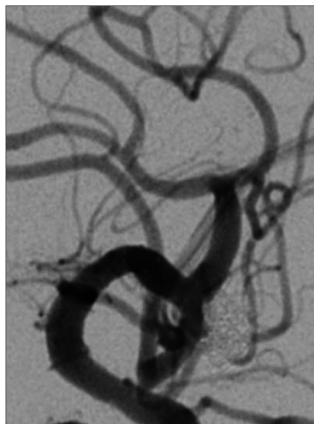
Fig. 6. Follow-up angiography was performed 13 months after treatment. Working unsubtracted view of right ICA angiography shows a no interval change after initial treatment.

The endovascular treatment of intracranial aneurysms with detachable coils has developed into a widely used and effective technique. Despite increasing clinical experience and technological improvements, endovascular treatment still has inherent risks of morbidity and mortality. In particular, this treatment is