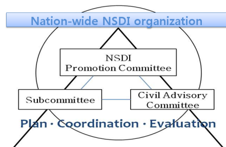
Figure 2. Upper system on NSDI

The upper system consists of nation-wide entities such as the NSDI Promotion Committee, Civil Advisor Committee, and Sub Committee, in order to plan, coordinate, to evaluate the NSDI.