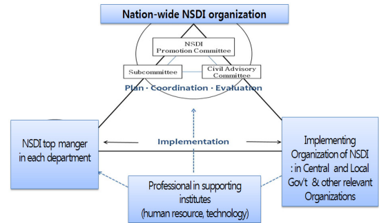
Figure 1. A model of NSDI Promotion System

system at the executive level. The upper and lower system should both be vertically connected and be horizontally connected[3].