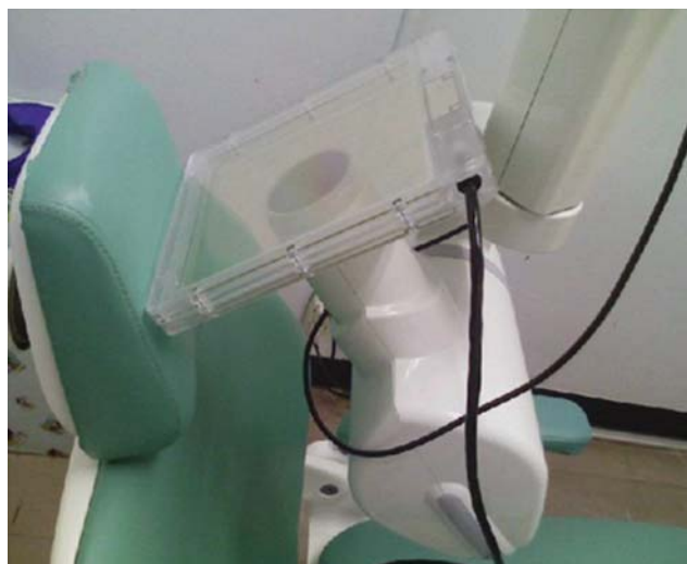
Fig. 1. The ionization chamber of DAP meter is positioned at the end of the exit cone of the intraoral X-ray machine for PED and DAP measurement.

The objectives of this study were to survey the radiographic exposure parameters, and measure the patient dose for intraoral dental radiography nationwide, and thus to establish the DRLs in intraoral dental X-ray examination in South Korea. This was the first nationwide investigation for the development of DRLs in intraoral dental radiography. The patient doses were measured with both dose quantities, PED and DAP, in order to compare them with previous reports from other countries.