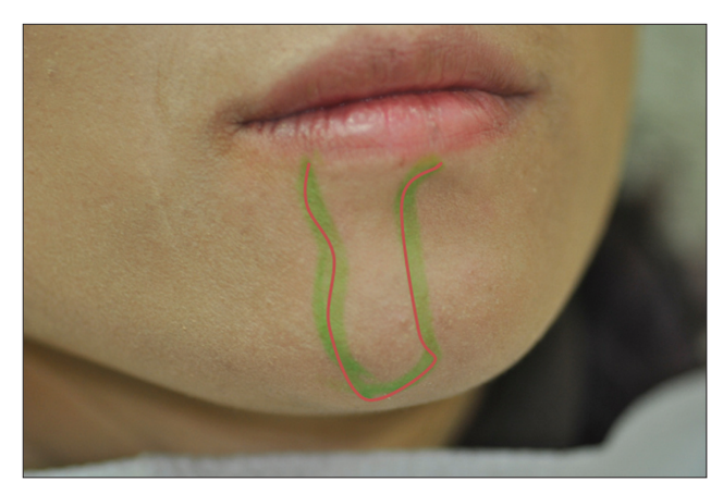
Figure 2. Mapping at 5 weeks follow-up after the nerve injury. The hypoesthetic region was reduced compared to the first mapping.