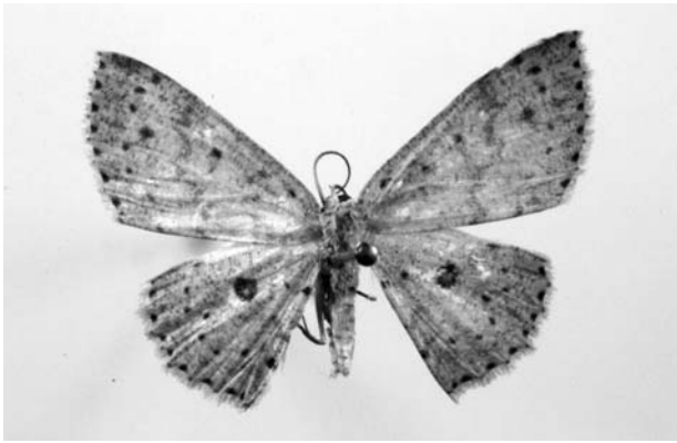
Fig. 1. Adult of Perixera punctata (Warren) from Korea.

Description (Fig. 1). Wingspan 19-21 mm. Antennae in male bipectinate with long rami, female filiform; frons broad, trapezoidal, covered with whitish scales; labial palpi long, almost three times of eye diameter, projected forward, laterally reddish. Body covered with whitish scales. Legs reddish or dark ochreous and white mixed scales. Forewing ground color light brown; basal line light blackish, projected at middle; discal dot blackish; postmedial line dark grayish, undulating; a relatively large dark grayish dot on subcosta between postmedian and subtermen; subtermen with blackish dots along postmedian; termen with black dots along terminal line; single areole. Hindwing ground color light brown; basal line blackish, weakly appearing; discal dot large dark brownish; postmedial line blackish, undulating; termen with a blackish undulating terminal line.