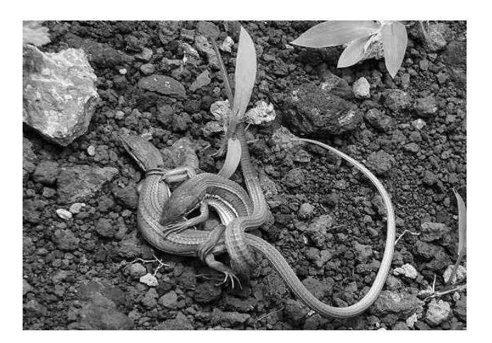
Figure 2. A photograph of the male Takydromus wolteri biting the flank of the female during the mating(Chang, 2011)

TL was generally found in SSD of lacertid lizards, and it was also the case with three of lacertid lizards of Korea. In Phrynocephalus vlangalii , males showed a tail growth rate higher than females, which is partly related with fecundity selection acting on female (Zhang et al. , 2005). The role of tail of male is very important because male widely move to meet superior female and constantly seek for prey owing to strong, and therefore tail of male is getting longer than female through an evolutional process.