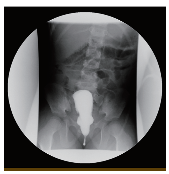
Fig. 3. Voding cystourethrogram showed severe bladder wall thickening with a shrunken bladder volume.

Urinary tract is a common site for infection in the pediatric population. Cystitis or lower urinary tract infection is an infection confined to the lower urinary tract giving rise to inflammation of the bladder. Cystitis is caused mainly by colonic bacteria. But noninfectious causes of acute cystitis such as systemic disease, radiation therapy, chemicals and medications should be considered in patients who have urinary symptoms and sterile pyuria.