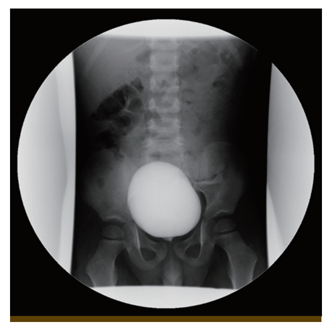
Fig. 4. Voiding cystourethrogram was performed 1 month later, and it showed normal bladder shape.