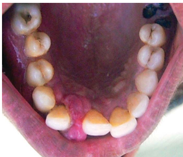
Fig. 4. Post-operative intraoral photograph shows regression of palatal lesion after selective embolization.

cedure well and had an unremarkable postoperative course. One week postoperatively the patient showed complete regression of the palatal lesion (Fig. 4). One year follow-up revealed a significant reduction of clinical symptoms