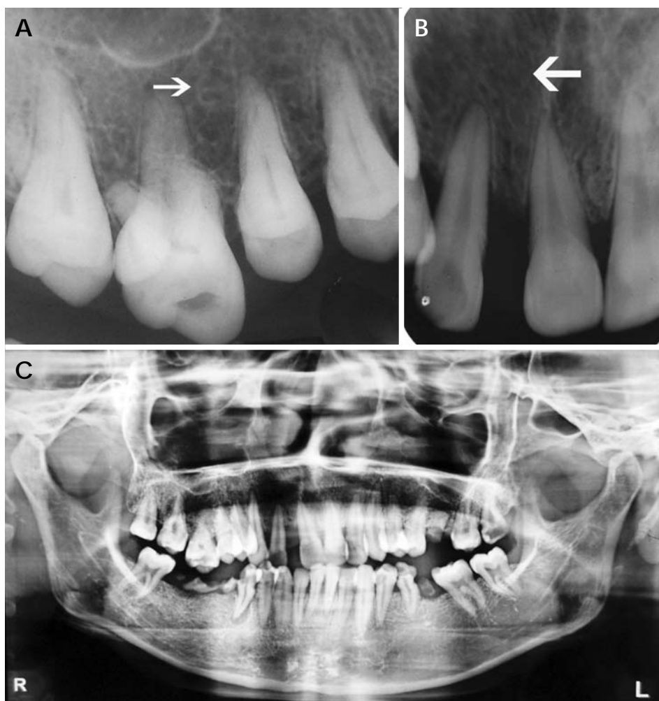
Fig. 2. Intraoral periapical radiographs show coarse bony trabeculae and enlarged marrow spaces. A. Right maxillary posterior portion. B. Right maxillary anterior portion. C: Panoramic radiograph shows an ill-defined irregular area of bone destruction in right maxillary anterior region.

and enlarged marrow spaces on the right maxillary anterior and posterior regions. Alveolar bone loss was revealed on the maxillary central and lateral incisor regions. Widening of periodontal ligament space was seen with lateral incisor, first and second premolar and the first molar was supraerupted (Figs. 2A and B). Panoramic radiograph showed ill-defined, irregular area of bone destruction extending from the mesial surface of the left maxillary central incisor upto the mesial surface of the right maxillary canine. The maxillary central and lateral incisors showed marked displacement (Fig. 2C).