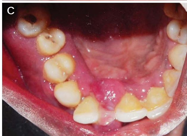
Fig. 1. A. Extraoral photograph shows port-wine stain and extraoral swelling. B. Intraoral photograph shows the extent of the lesion from buccal aspect. C. Intraoral photograph shows the palatal extent of lesion.

ient was subjected to radiographic examination. Intraoral periapical radiographs showed coarse bony trabeculae