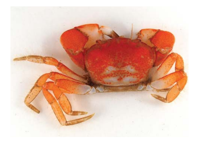
Fig. 3. Zehntneriana amakusae, male (cl 5.5 mm from Munseom Island). cl, carapace length from the tip of frontal margin to the posterior dorsal margin of the carapace.

Ambulatory legs (Fig. 4D-G) generally long, stout, leg 3 longest; meri minutely serrated on anterior margins; carpi