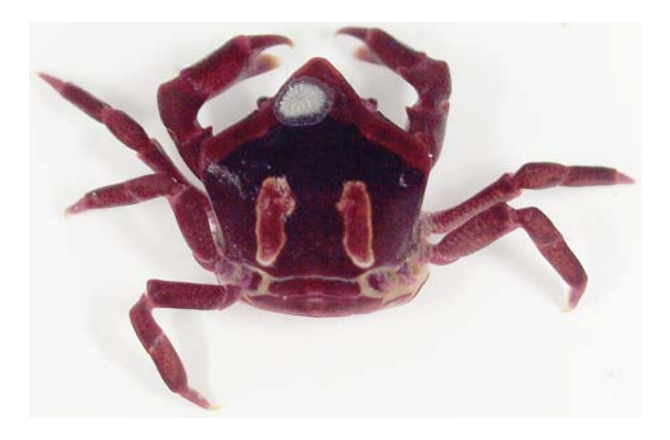
Fig. 1. Echinoecus nipponicus, female (cl 7.8 mm from Hyeongjeseom Island). cl, carapace length from the tip of frontal margin to the posterior dorsal margin of the carapace.

<sup>2*</sup>Echinoecus nipponicus Miyake, 1939 (Figs. 1, 2) Echinoecus petiti nipponicus Miyake, 1939: 86, 88, 90, textfig. 1-3B.