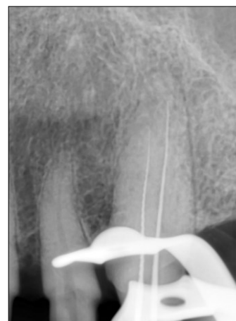
Figure 4. Files are placed within the root canal to identify the canal path.