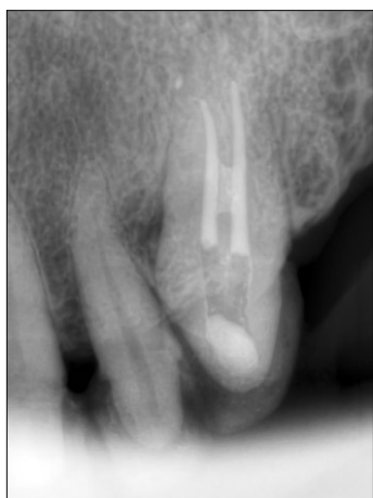
Figure 5. Radiographic image after canal filling. The root canal showed communicating pattern at middle one-third point.