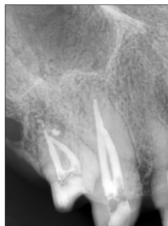
Figure 6. Radiographic image of maxillary right canine of the same patient. Two separated canals converging at the apical one-third point can be seen under the canal filling condition.

the ranges of approximately 2 - 3% as the below Table 1. 4,5 These studies related to the root canal anatomy of the maxillary canine are summarized in Table 1.