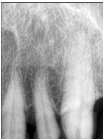
Figure 1. Preoperative radiograph of left maxillary canine. There was no special periapical pathosis.

Generally, it is considered that all maxillary canines only have a single canal. 2,3 However, two studies have been reported that a maxillary canine is composed with two root canals in the possibility of