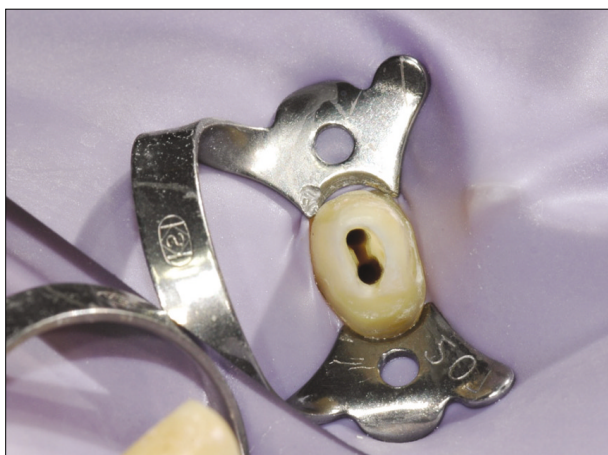
Figure 3. Clinical pictures after access opening. Two separated orifices can be clearly observed.