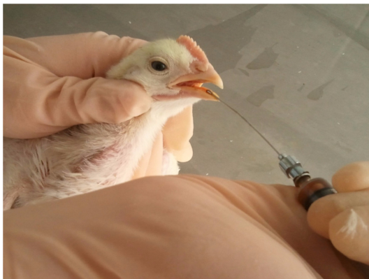
Fig. 1. The chickens were orally inoculated by gavage by using a 24-gauge stainless-steel animal-feeding tube, which is used for feeding mice, attached to a 3-mL syringe.

During the study period, the animals were checked twice daily for morbidity and mortality. Further, we compared the clinical signs, changes in body weight, number of oocysts shed in the feces of the control and inoculated groups. Fecal samples were collected from 6 to 10 days post-infection, and the number of oocysts was determined using a McMaster counting chamber. Total