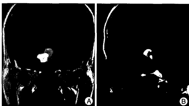
Fig. 1. Brain T 1 -weighted magnetic resonance (MR) images showing a sellar tumor with suprasellar extension in the coronal (A) and sagittal (B) planes. MR images demonstrate a mixed-signal sellar mass compressing the optic chiasm.

VA : visual acuity, VF : visual field, OP : ophthalmoplegia