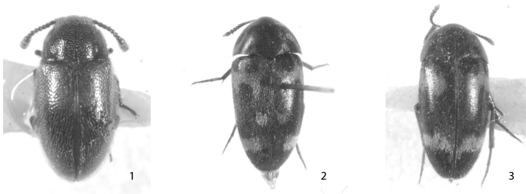
Figs. 1-3. Habitus of Tetratomidae. 1. Pisenus insignis ; 2. Holostrophus ( Paraholostrophus ) orientalis ; 3. Holostrophus diversefasciatus (female).

middle part and apical part; or sometimes scutellar patch extended posteriad and connected with median band.