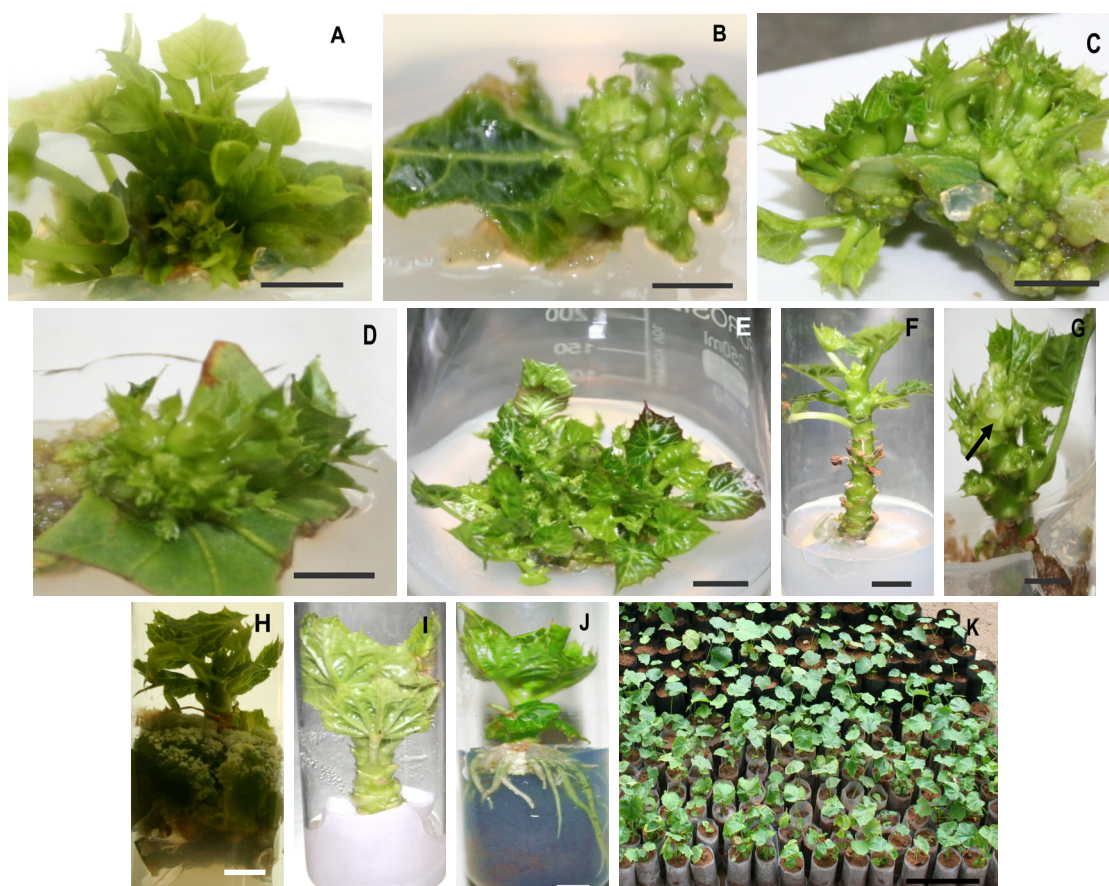
Fig. 1. Plant regeneration from leaf explants of non-toxic Jatropha curcas . Plant regeneration from (A) in vitro mature leaf explant (bar 5 mm), (B) Field-grown mature leaf explant (bar 5 mm), (C) in vitro cotyledonary leaf explant (bar 5 mm) and (D) Glasshouse-grown cotyledonary leaf explants (bar 5 mm) on MS medium with 2.27 \mu\text{M} thidiazuron (TDZ) after 6 weeks. (E) Shoot proliferation of regenerated shoot buds on MS medium with 10 \mu\text{M} kinetin (Kn) + 4.50 \mu\text{M} 6-benzyl aminopurine (BAP) + 5.50 \mu\text{M} \alpha -naphthaleneacetic acid (NAA) after 4 weeks (bar 75 mm). (F) Elongation of proliferated shoot on MS medium with 2.25 \mu\text{M} BAP + 8.5 \mu\text{M} indole-3-acetic acid (IAA) after 6 weeks (bar 5 mm). (G) Elongation of proliferated shoot on MS medium with 2.25 \mu\text{M} BAP + 2.5 \mu\text{M} indole-3-butyric acid (IBA) after 6 weeks (bar 5 mm; arrow indicate proliferation of axillary buds). (H) Elongation of proliferated shoot on MS medium with 2.25 \mu\text{M} BAP + 8.25 \mu\text{M} NAA after 6 weeks (bar 5 mm; arrow indicate formation of callus at the base). (I) Elongated shoot cultured on half strength basal MS liquid medium supplemented with 15 \mu\text{M} IBA + 5.7 \mu\text{M} IAA + 5.5 \mu\text{M} NAA for root induction (bar 1 mm). (J) Development of roots at the base of auxins treated elongated shoot on half strength basal MS medium with 0.25 mg/l activated charcoal after 4 weeks (bar 1 mm). (K) Regenerated plant in polythene bags after 2 weeks (bar 100 mm) (Source; Kumar et al. , 2011b)

Genotype is also one of the most important factors affecting regeneration (Tyagi et al. , 2001; Gubis et al. , 2003; Gandonou et al. , 2005; Feyissa et al. , 2005; Chitra and Padmaja, 2005; Landi and Mezzeti, 2006; Reddy et al. , 2008; Kumar and Reddy, 2010). Genotypic effect on shoot regeneration and elongation has been described in many species, and could be due, in part, to differences in the levels of endogenous hormones, particularly cytokinins