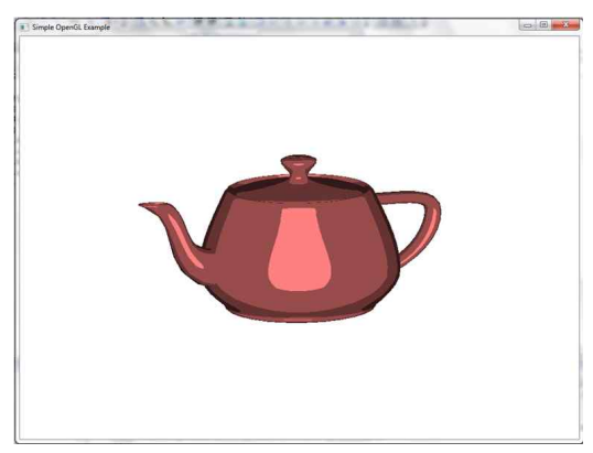
그림 4. GLSL 결과 Fig. 4. Result of GLSL

Figure 3 present example code interactive computer graphics [5]. It uses with GLSL source coding in OpenGL. Figure 4 shows result of this example code, also present cel shading with silhouette.