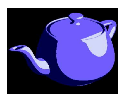
그림 8. 스토크를 가진 셀 세이딩 [9] Fig. 8. Cel shading with stroke using Rendermonkey[9]

Figure 6 and 7 show the HLSL coding result in DirectX. This result is created by cartoon shading. Figure 7 present cel shading with stroke.