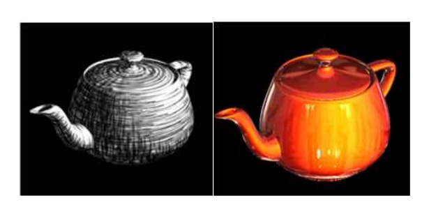
(a) Hatching (b) Two-Tone Car Paint 그림 1. 렌더멍키를 이용한 비사실적 렌더링효과 Fig 1. NPR effect using Rendermonkey

First, it is need to explain cartoon shading. Especially, NPR is the contrast of the photorealism. Recently, NPR is important and impressive branch of computer graphics. The model in 3D environment, NPR works to increased availability of programmable GPU's and applies to the rasterised image, then result is displayed on the screen. NPR techniques attempt to create images or virtual worlds visually comparable to renderings produced by a human artist [5].