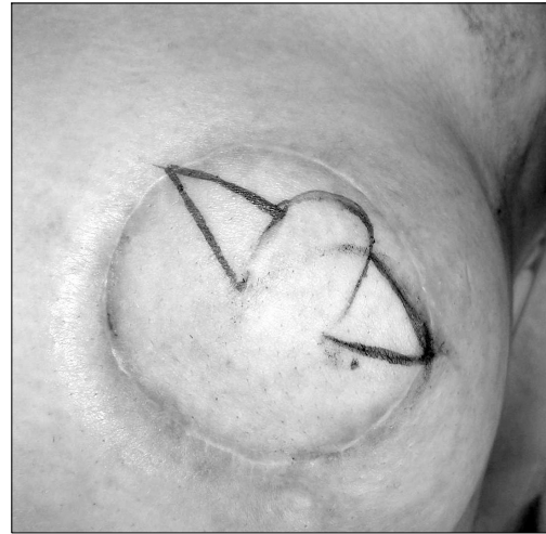
Fig. 3. Intraoperative design: inset skin flap length was longer than the total length of the C-V flap.

The elevated mound surrounding the NAC was well maintained for an average follow-up period of 12.2