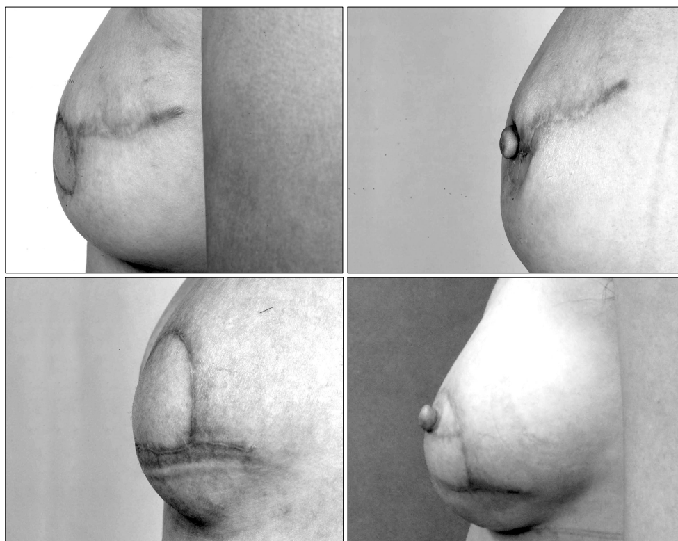
Fig. 4. (Above, left) Postoperative photo after breast reconstruction with a TRAM free flap on a 32-year-old woman where the proposed technique was not used. Flat flap brake periareolar contour. (Above, right) Postoperative photo after nipple reconstruction using a C-V flap in the same patient. (Below, left) A 43-year old woman's postoperative photo after using the purse-string suture technique four months later. The breast contour is maintained. (Below, right) Postoperative view six months after the nipple reconstruction operation.

In breast reconstruction after skin-sparing mastectomy including periareolar resection, more favorable results that carry less surgical stigma compared to previous conventional methods can now be achieved using this concept. The technique requires no supplementary incisions or complicated skills, so surgeons can apply this method easily.