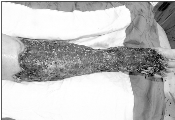
Fig. 2. Intraoperative picture of first surgical debridement of right lower leg.