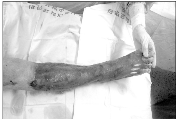
Fig. 3. Intraoperative picture of right lower leg before split thickness skin graft. The first split thickness skin graft was performed above the right ankle on the 87th day.

Group A Streptococcus pyogenes and Gram positive bacilli. She was treated with Ampicillin. 38 days after surgery, Wound cultures result showed Acinetobacter baumannii and Methicillin resistant Staphylococcus epidermidis . She was managed with imipenem and levofloxacin, but the patient presented allergic reactions such as urticaria and thrombocytopenia. The patient's antibiotics were changed to Vancomycin and 20 days later, wound cultures turned negative.