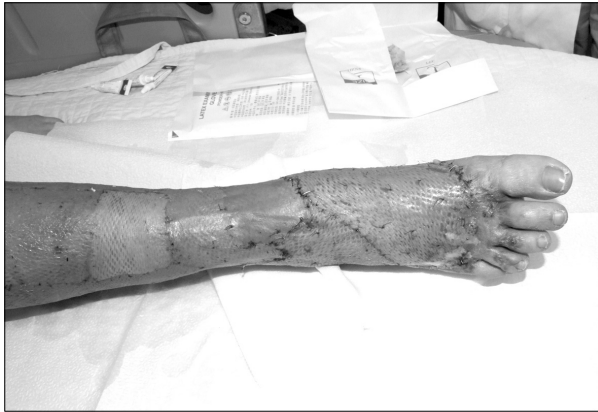
Fig. 4. After coverage of the partially exposed extensor digitorum longus tendon with granulation tissue, second split thickness skin graft was performed on the 98th day.