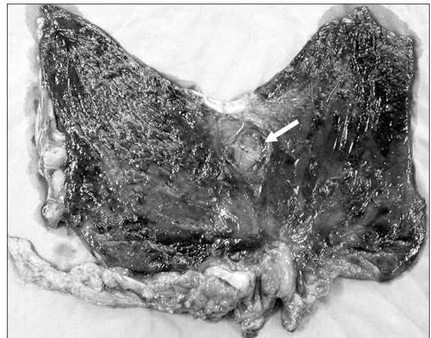
Fig. 3. Finding of the resected stomach. Near total gastric mucosal necrosis and longitudinal dehiscence at lesser curvature side were identified (Arrow = longitudinal dehiscence of the gastric wall at the lesser curvature side).

struction and performed emergency laparotomy. Operative findings revealed that the stomach was massively distended and that a large sludge of the soaked laver was impacted at the antrum when gastrotomy was performed. After the removal of gastric contents, we examined the gastric mucosa. The entire gastric mucosa exhibited generalized edematous changes and easily came off with palpation (Fig. 2). We observed several enlarged lymph nodes around the perigastric area and mild hardness of the antrum; however, there were no obvious findings suggesting gastric cancer despite the severe gastric dilation. We suspected gastric cancer associated with gastric outlet obstruction. However, we did not perform a definitive cancer surgery because of the patient's condition. The patient un-