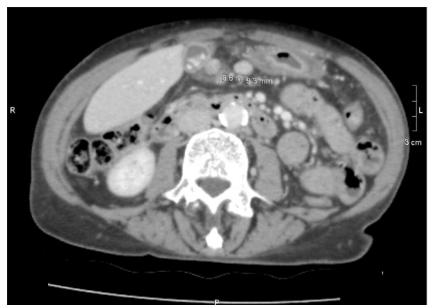
Fig. 2. CT abdomen demonstrates the mesenteric lymphadenopathy, showing two lymph nodes measuring 8.6 and 9.3 mm. CT = computerized tomography.

The tumour cells are diffusely and strongly positive for oestrogen receptors, negative for progesterone receptors, positive for E-cadherin which is consistent with an invasive ductal carcinoma and Herceptin 2 receptors positive.