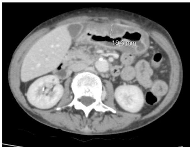
Fig. 1. CT abdomen showing thickening of the gastric antrum which measured approximately 19.3 mm. CT = computerized tomography.

ER \alpha = oestrogen receptor \alpha ; GCDFP-15 = gross cystic disease fluid protein-15.