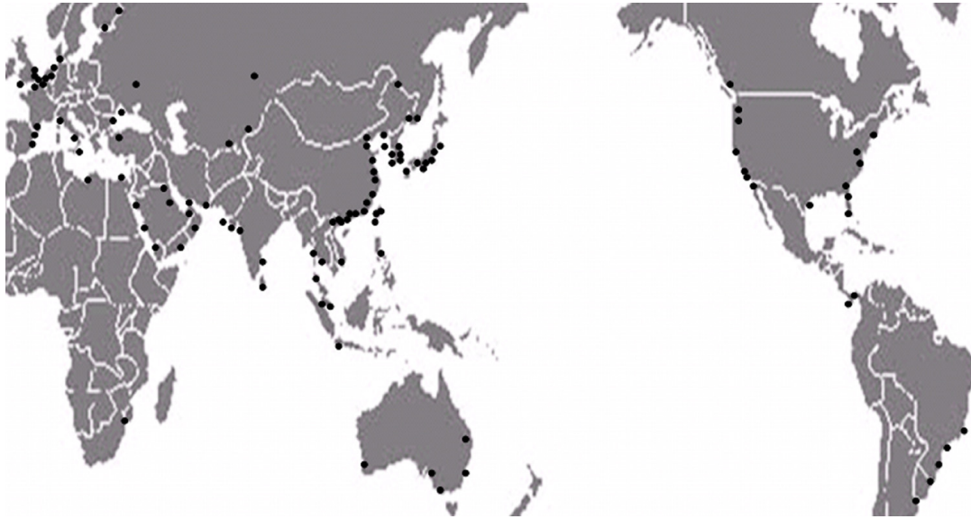
Figure 1. Global network of the company

sition plans were developed manually by company container operators with more than three years experience due to the problem complexity. However, obtaining high-quality solutions by hand was difficult due to the absence of any tool to evaluate the impact of the container operators' decisions. This raised the costs and lowered the level of demand satisfactions. Therefore, the company decided to automate the repositioning process by incorporating an optimization model. The objective of our project was to develop a planning system that would be compatible with the company's operational practices and that could quickly formulate reposition plans. A key module in the planning system was the linear programming model generating reposition plans for several types of empty container.