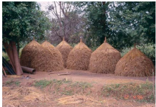
Plate 1. Straws can support moderate-high levels of production in ruminants with efficient means of treatment and supplementation. Photo shows rice straw conservation for feeding ruminants in Cambodia.

Ruminant production from poor quality roughages like cereal straws has a downside concerning methane