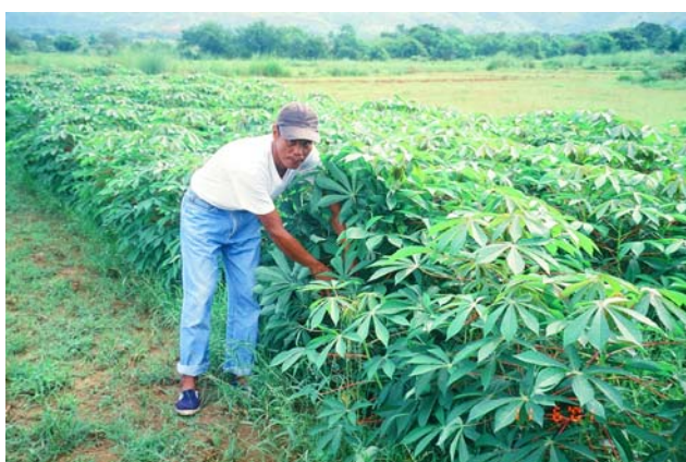
Plate 3. Cassava leaves are widely used as a source of supplementary dietary proteins. The photo shows cassava cultivation in Thailand (C. Devendra).