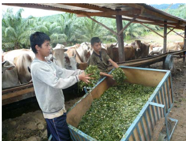
Plate 2. The oil palm environment enables stratification and provides many benefits to integration with ruminants. The photo shows chopped oil palm fronds being fed to cattle in feedlot in Sabah, Malaysia.

The large land area under oil palm offers major opportunities to integrate with ruminants and increase total factor productivity. Such systems enable good linkages between production and post-production systems, and environmental sustainability, including carbon sequestration. The integration model with oil palm offers extension of the principles involved with other tree crops like coconuts in the Philippines, Sri Lanka and South Asia, rubber in Indonesia, and citrus in Thailand and Vietnam.