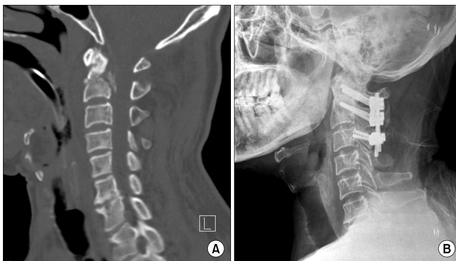
Fig. 1. (A) Computed tomography (CT) scan of the cervical spine with the bone-window setting showing a burst fracture of C2. (B) Postoperative plain lateral radiography showing C1-C3 screw fixation.