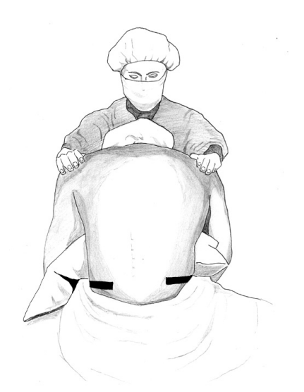
Fig. 1. Sitting position with the neck flexed and arms crossed for thoracic epidural puncture.

Judging that the epidural anesthesia failed, general anesthesia was performed under the agreement of the patient. To induce general anesthesia, 2% lidocaine 2 mlpropofol 2 mg/kg-atracurium 0.6 mg/kg was intravenously injected, and the anesthesia was maintained with O_2-N_2O- desflurane. The operation was carried out for 1.5 hours, and epidural anesthesia failure was reconfirmed when the patient complained of pain in the operated region in the