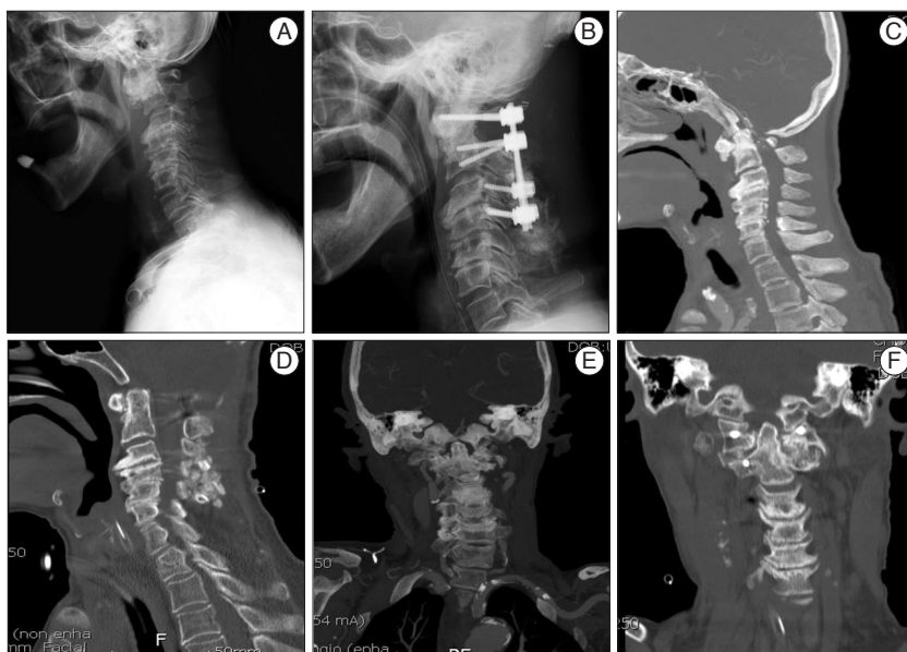
Fig. 2. Case 2 image findings. A : Preoperative X-ray showing severe kyphosis with degenerative spondylotic change and increased ADI about 9 mm and BI. B : Postoperative X-ray showing correction of cervical kyphosis and reduction of BI as well as C1-4 fixation. C-F : Compared with preoperative CT, postoperative CT showing decompressed craniovertebral junction and distracted joint space in which in which autograft iliac bone spacer (arrow) have been placed. ADI : atlanto-dental interval, BI : basilar invagination, CT : computed tomography.

ments, vertebral artery, and spinal cord, factors that should be considered in the surgical decision making are numerous and complex 13 . Among them, for AAI and BI cases with the symptom of the protruded odontoid tip compressing the spinal cord or the brain stem in the ventral side, the choice treatment was to perform first anterior transoral odontoidectomy and occipitocervical fusion or cervical traction and thus performing the release of the ligaments around the odontoid process, and subsequently to perform posterior fusion 4,12,17,18 .