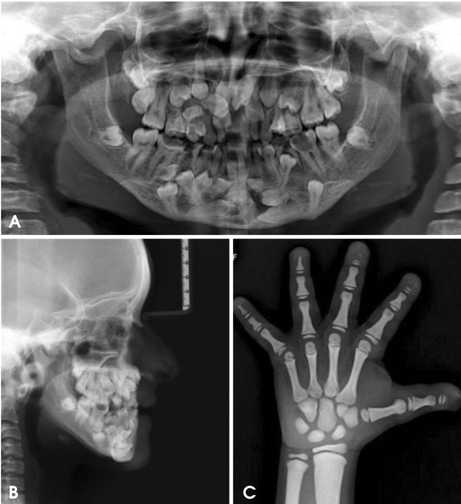
Fig. 3. A. Panoramic radiograph shows multiple impacted permanent and supernumerary teeth. B. Lateral cephalogram shows hypoplastic paranasal sinuses with relative mandibular prognathism. C. Hand-wrist radiograph shows acro-osteolysis of terminal phalanges.