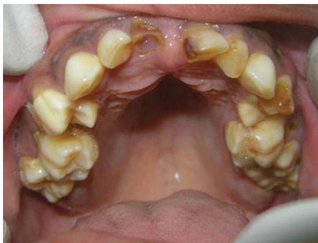
Fig. 2. Intraoral photograph shows V-shaped high arched palate with midline groove and multiple retained deciduous teeth.

ridge of the palate, high arched palate, multiple retained deciduous carious teeth, crowding, and enamel hypoplasia (Fig. 2). Based on the above findings, the differential diagnoses include osteopetrosis, pyknodysostosis, cleidocranial dysplasia, and idiopathic acro-osteolysis.