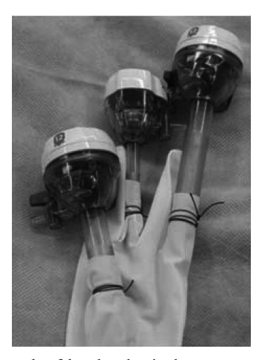
Fig 1. Photograph of handmade single-port system. The three trocars attached to the surgical glove served as three working channels.

Aseptically prepared single-working channel endoscope (Scope: EG-250HR2, Processor: EPX-201H, Fujinon<sup>TM</sup>, Fuji Photo Optical CO LTD, Japan) was inserted into abdominal cavity though the 12 mm trocar. Once inserted, the gall bladder was identified and for the better visualization of cystic duct and artery, laparoscopic grasping forcep (FG49L-1, Olympus Optical LTD, Japan) was used for the traction of gall bladder (Fig 2B, 2C). The 5 mm automatic endoscopic Hem-o-lok applier (Hem-o-lok<sup>®</sup>,TFX Medical, Ltd., UK) was inserted through the 5 mm trocar and cystic duct and artery were triple ligated with 5 mm clips and transected by L-knife (KD-620LR, Olympus Optical LTD, Japan) through working channel of the endoscope (Fig 2D, 2E). Blunt dissection was begun using rotating Maryland dissector (LA1201-01 Maryland dissector, Autono-my<sup>TM</sup>, Laparo-Angle<sup>TM</sup>, Cambridge Endoscopic Devices Inc.,