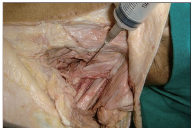
Fig. 2. In cadaveric study, needle depth is typically within a range of 2 to 4 cm depending on body habitus and needle angulation with the surface.