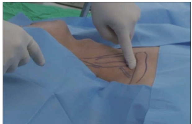
Fig. 1. The anterior scalene muscle, middle scalene muscle, brachial plexus are identified and tenderness point is checked by pressing gently along anterior scalene muscle and middle scalene muscle. In most cases, tenderness at 3-4 points is found, especially around proximal, distal end and middle area of the muscle.

Patients were comprised of 74 men and 68 women with a mean age of 47 years (range 18-80) and a mean follow-up period of 38 months (range 12-64). Their TOS etiologies included 71 cases of trauma-related injury and 71 cases of work-related repetitive stress. The trauma-related injuries included 38 cases