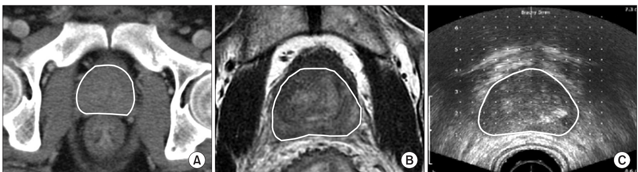
Fig. 1. Contouring of prostate based on different imaging modality. 3 images of one patient were used to contour prostate. (A) Computed tomography-based contouring of prostate. (B) Magnetic resonance imaging-based contouring of prostate. (C) Transrectal ultrasound-based contouring of prostate.

Values are presented as number or median (range). CT, computed tomography; MRI, magnetic resonance imaging; PSA, prostate specific antigen; NHT, neoadjuvant hormone therapy since the date of image study among patients who had hormone therapy.