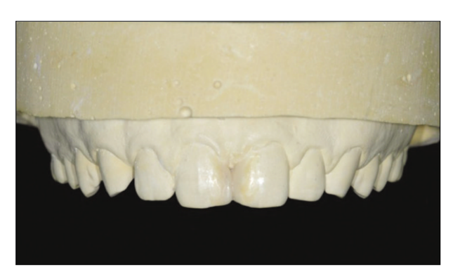
Figure 3. The dental cast was waxed up to establish the shape of the restoration.

In this case, because of the large space and thick gingival biotype, the increase of emergence profile was difficult. Willhite suggested the diastema closure using a narrowed Mylar strip and cotton pellet to increase the emergence profile and gingival tissue recontouring. Accordingly, this procedure was applied in this case. The patient was anesthetized, and teeth were isolated with insertion of a gingival retraction cord (Figure 4a). A Mylar strip was cut lengthwise to extend out of the sulcus by approximately 1 mm and then was placed in a particular fashion. The narrowed strip was fully seated into the sulcus and a small cotton pellet was placed between the tooth and the Mylar strip, and gently packed into the sulcus (Figure 4b). After 5 minutes, cotton pellet was removed to gain the empty space through the gingi-