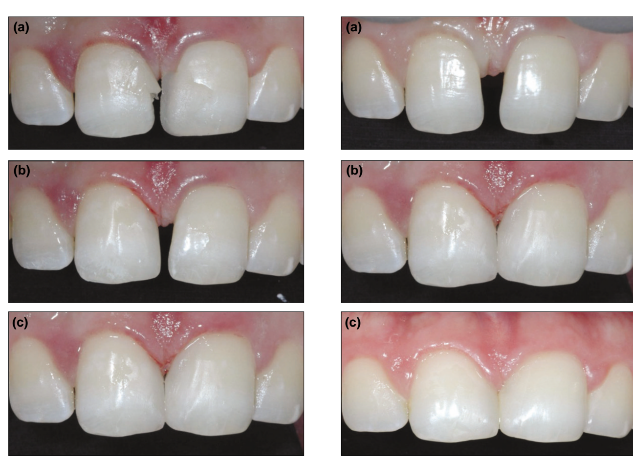
Figure 5. (a) After resin build up to the contact point, (b) Completion of resin build-up of #11, (c) Completion of resin build-up of #21.