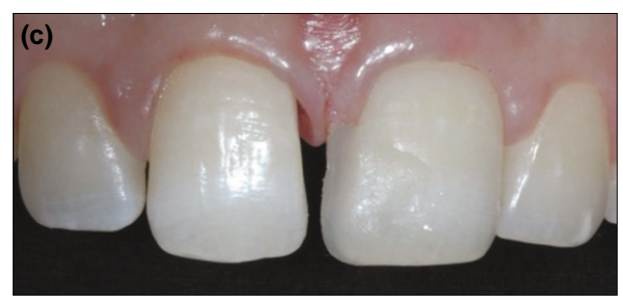
Figure 4. (a) Isolation with a retraction cord, (b) The strip was fully seated and a small cotton pellet was placed, (c) After removal, leaving the space.