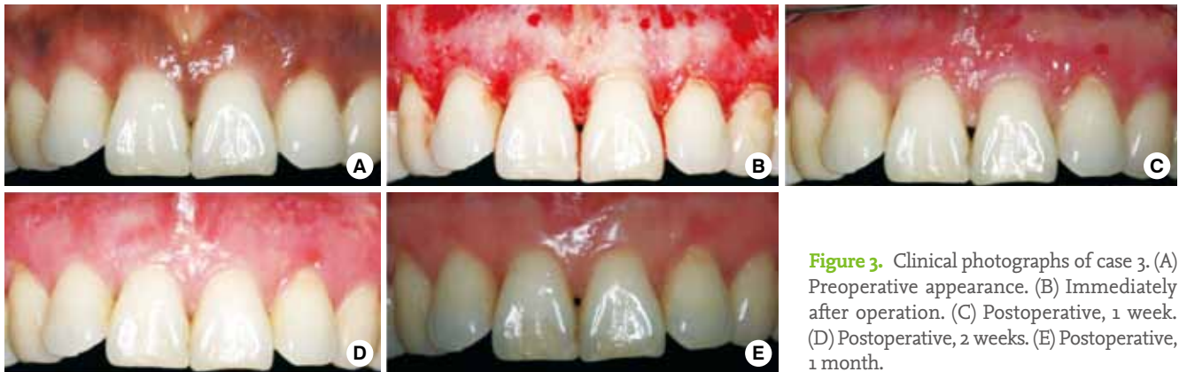
Figure 3. Clinical photographs of case 3. (A) Preoperative appearance. (B) Immediately after operation. (C) Postoperative, 1 week. (D) Postoperative, 2 weeks. (E) Postoperative, 1 month.