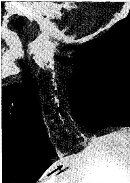
Fig. 1. Conventional lateral plain radiograph of cervical spine vaguely shows a displaced fracture together with an obvious gap (arrow) in the anterior column at C6-7 because the rigid elevation of the shoulders prevents adequate imaging at the cervico-thoracic junction.

Because the combined anterior and posterior internal