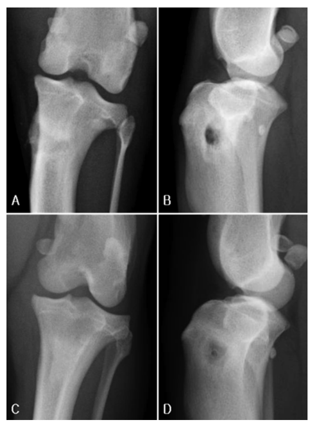
Fig 1. Craniocaudal (A) and lateral (B) radiographs of the left stifle joint show a geographic focal lucency surrounded by sclerosed margin in medial aspect of proximal tibial metaphysis. Craniocaudal (C) and lateral (D) radiographs at 37 days follow-up show partial filling up of the lesion.

placement of left patella and joint effusion were identified. On ultrasonographic examination, cortical disruption was clearly identified. A large, echoic wedge-shaped area was