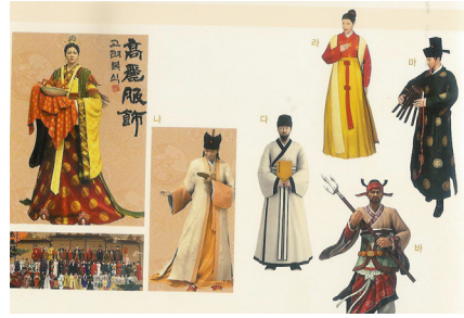
Fig. 1. Development of fashion culture of Goryeo,

Providing visual and auditory data from cyber museum of Goryeo clothing to institutions and fashion companies can be utilized for promoting publications about clothing and design. Also the data can be applied to character design for a movie, folk tale, and game, and to production for animation, public performance, and a play or drama. Figure 1 shows development of fashion culture of Goryeo by the Dream Hans [2].