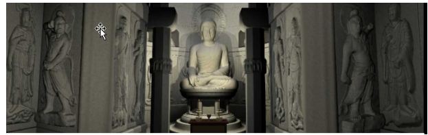
Fig. 7. Seokguram 3D graphic virtual reality

Digital restoration of Seokguram was created through 3-D scanning. Three-dimensional scanning is a method of reflecting laser to a sculpture, using the angle from projected laser and calculating the shape and the refraction of a solid into a data. It is used for the reproduction of delicate 3-D sculptures that cannot be represented in 3-D modeling. We save scanned data of Seokguram on the computer and use them after mapping the quality of the stone cave. With restored digital contents of Seokguram, the world biggest movie theater, exclusively for virtual reality, was built and the culture of the Silla Dynasty was restored and screened in Gyeongju World Culture Expo 2000. It was a project for neglecting time and space that we provided a stereophonic sound with 8 channels of surrounding volumes and 22 speakers for virtual reality, and also made people use their five senses to experience a scent of pine and acacia for the function of smell. Figure 7 shows Seokguram 3D graphic virtual reality [9].