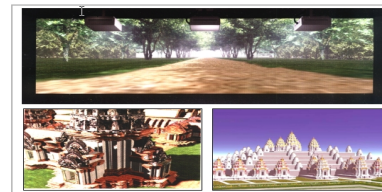
Fig. 5. Angkor Wat 3D digital graphic

A historic site in Cambodia, Angkor Wat, is superior to an ancient Greek temple and Rome's ancient Coliseum in its artistry and magnificence. The restoration of Angkor Wat in 3-D graphics has been tried, and what means the most is that digital restoration through worldwide CT technology of Korea and producing Angkor Wat as contents in a digital form were possible. Restoration by way of analog method is important, however, digital restoration can be put to practical use, which is much more excellent in cost and commercial utility. Figure 5 shows Angkor Wat 3D digital graphic [6].