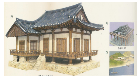
Fig. 2. Traditional Han-Ok Maeul set development,

Based on the surveyed information, architectural structures and space function of Han-Ok will provide practical resources and arrangement for the space, and it can be applied as design for theatrical art and a broadcast set, and as background for a game, movie, and drama. Figure 2 shows traditional Han-Ok maeul set development by the Yeogeum [3].