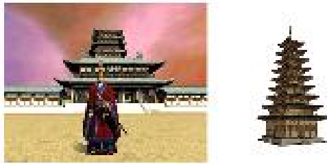
Fig. 6. Baekje Mireuksaji 3D Restoration