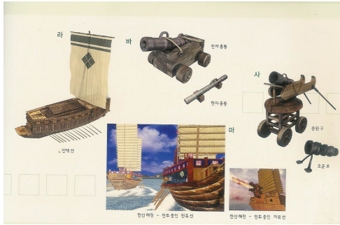
Fig. 3. Traditional merchant marine digital restoration,