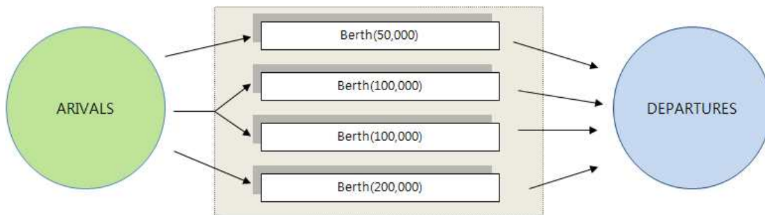
<Fig. 1> Queuing System under the Specific Port Structure

We consider some stochastic models in attempting to estimate the queuing cost that is expected to increase exponentially according as the POSCO depends on either the ships classed 200,000-ton or classed 50000-ton because of both the limited number of berths and the increasing number of voyages.